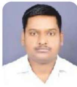
Vishwakumar Kadam ACG Capsule, Shirwal