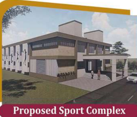
Proposed Sport Complex