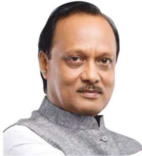
Hon. Shri. Ajit Pawar Deputy Chief Minister (Maharashtra)

Hon. Shri. Ajit Dada Pawar has been active in advocating to improve the quality of education in our Sanstha. His efforts have focused on making education more inclusive, equitable and accessible to all sections of society in the rural area by enhancing infrastructure. He has been instrumental in minutely monitoring the development of various educational campuses of the Sanstha.