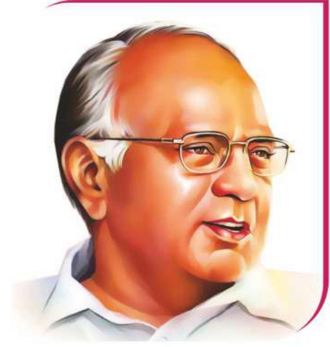
Padma Vibhushan Hon. Shri. Sharadchandra Pawar