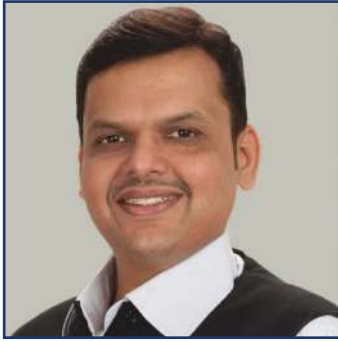
Hon. Shri. Devendra Fadnavis Dy. Chief Minister, Maharashtra State