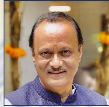
Hon. Shri. Ajit Pawar Dy. Chief Minister, Maharashtra State