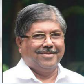
Hon. Shri. Chandrakant Patil Minister, Higher & Technical Education, Government of Maharashtra