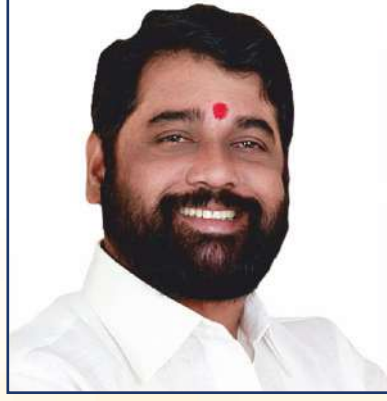
Hon. Shri. Eknath Shinde Chief Minister, Maharashtra State